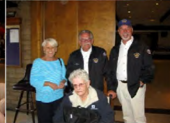
Fun times at Bent Axles Santa Maria car show. We all had a great time and of course the weather was fantastic. They sure do know how to put on great show. See you all next year Bent Axles.....