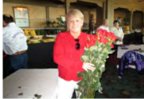
Fun time was had by all at our Valentine's Brunch. We had over 70 attending this year and the ladies sure loved the roses.