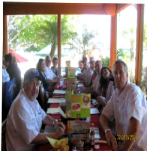
Our trip to the USS Iowa in San Pedro was a blast. Boy is that one big ship. After our tour we went to lunch at Acapulco's.